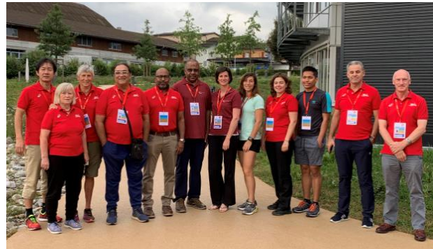
World Junior Para Athletics Championship 2019, Nottwil, CH https://www.youtube.com/watch?v=1K13HbMhr6Q