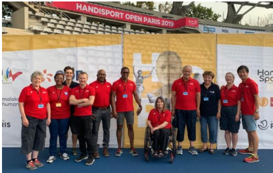
Handisport 2019, Paris, France http://www.handisport-open-paris.org/

Department of Medicine University of Toronto